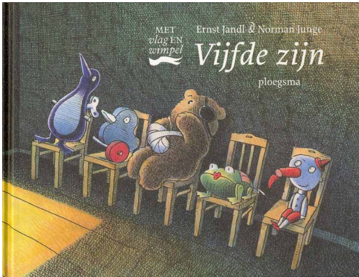
Fig. 1: Cover Dutch version of ›Being fifth‹