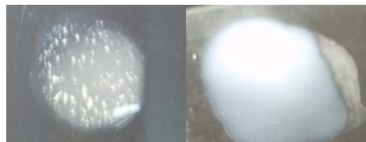
Figure 1: Coagulase test for Staphylococci . Control test (left) showing clumping when Staphylococcus aureus suspension reacted with human plasma while the reaction test (right) with coagulase negative Staphylococci showing no clumping

The PCR based detection of different antimicrobial resistance genes showed the presence of aacA-aphD gene in 3 isolates (23 %), erm(A) gene fragment in 3 isolates (23 %), tetK gene fragment (360 bp) in 4 isolates (30.7 %) and tetM in 6 (46.1 %) isolates. The blaZ gene which confers resistance to penicillin was detected in 3 isolates (23 %). No amplification was observed with primer sets used for genes reported to confer resistance against vancomycin. In the duplex PCR for MeccA and mecA , responsible for conferring resistance to methicillin, the MeccA was amplified in 3 isolates (23 %) and mecA was amplified in 2 isolates (15.3 %) while in 3 phenotypically resistant isolates, no gene was detected for methicillin resistance. The gene fragment of bla TEM-1 was amplified (962 bp) in 3 isolates (23 %) while the gene aac(6')/aph(2'') responsible to confer resistance to gentamicin was found (1184 bp) in 4 isolates (30.7 %). The representative amplified products are shown in Figure 3.