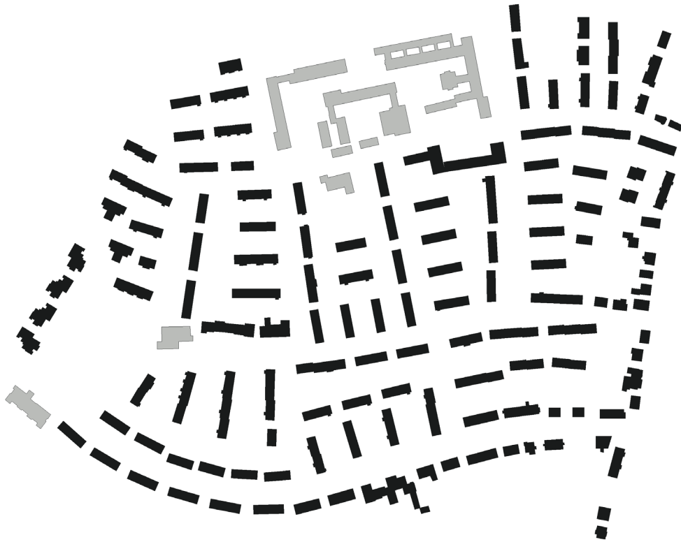
Fig. 2: Figure-ground-plan of the Hattinger Südstadt

Therefore, the previously agriculturally used and – due to unsafe building ground – not yet developed area encompassing 150,000 m 2 south of the old town was developed as a new district. In 1952, the building program for the “Südstadt” was presented, and in the same year, the cornerstone for the first construction phase, comprising 80 housing units, was laid. In spite of adverse circumstances, the residential building cooperative was able to complete 500 flats in the first two years. Due to urban planning and design, the new district corresponded to the guiding architectural and urban planning principles of the 1950s. According to the ideas of the Charter of Athens, the district was only designed as residential area.