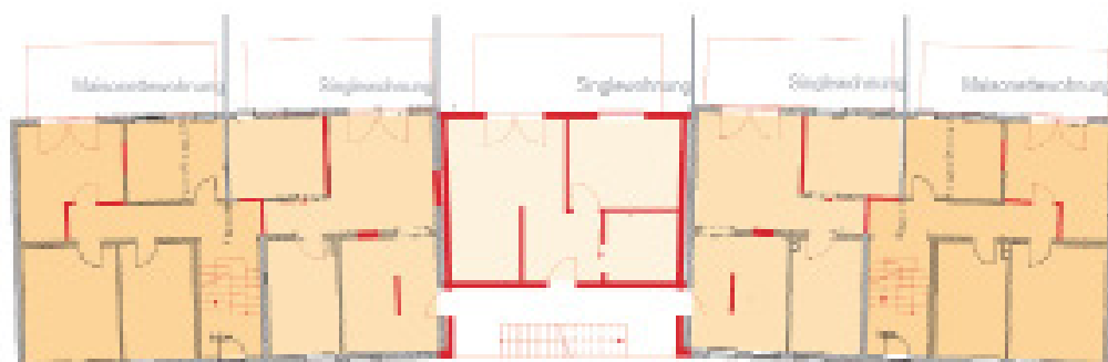
Fig. 6: New apartment layouts for different residents

"Refurbishment is a word that very quickly awakens emotions" (Interview, Executive Assistant, HWG). Among older residents, certain reservations and fears exist regarding the refurbishment of apartments. Older tenants can often not understand the need for planned measures, since these residents have become used to the living situation that they have had for decades. They often do not realize the advantages that would emerge through structural and technical improvements, an accessible and safe design of the