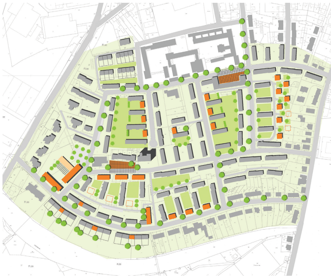
Fig.5: Neighborhood Concept for the Südstadt

For the purpose of a comprehensive concept, the requirements of older people are placed in the middle point, although the neighborhood concept for Südstadt also displays ways through which the district can be made more attractive for other resident groups as well as urban revitalization. This includes the “relationship between living within the dwelling and participating in happenings outside of it [...] such as the social relationships between older people and between generations” (BMBau 1995: 14f). In the following, three of the conceptual building blocks are described as examples.