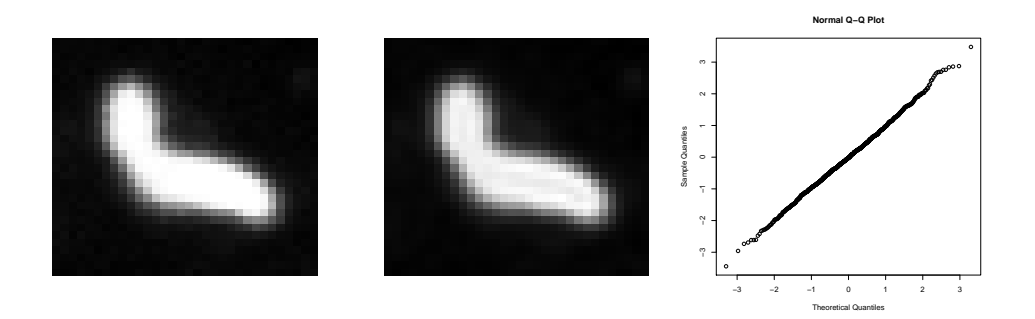
FIGURE 3. From left to right: 32 \times 32 pixel section of the HeLa image data rendered in grayscale, its reconstructed version (grayscale), a normal QQ-plot of the resulting standardized regression residuals.

resulting standardized regression residuals. In both cases, as in Section 4.1, when nonparametric smoothing is applied the smoothing parameter is chosen by minimizing the leave-one-out cross-validated estimate of the mean squared prediction error.