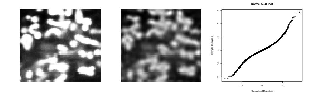
FIGURE 4. From left to right: 64 \times 64 pixel section of the HeLa image data rendered in grayscale, its reconstructed version (grayscale), a normal QQ-plot of the resulting standardized regression residuals.

normality, which confirms that the hypothesis of the normally distributed errors is inappropriate. Here we can see the reconstruction is now not as accurate as it was for the previous case. In conclusion, we can see the approach of using the proposed test statistic T_0 for assessing convenient forms of the error distribution is useful.