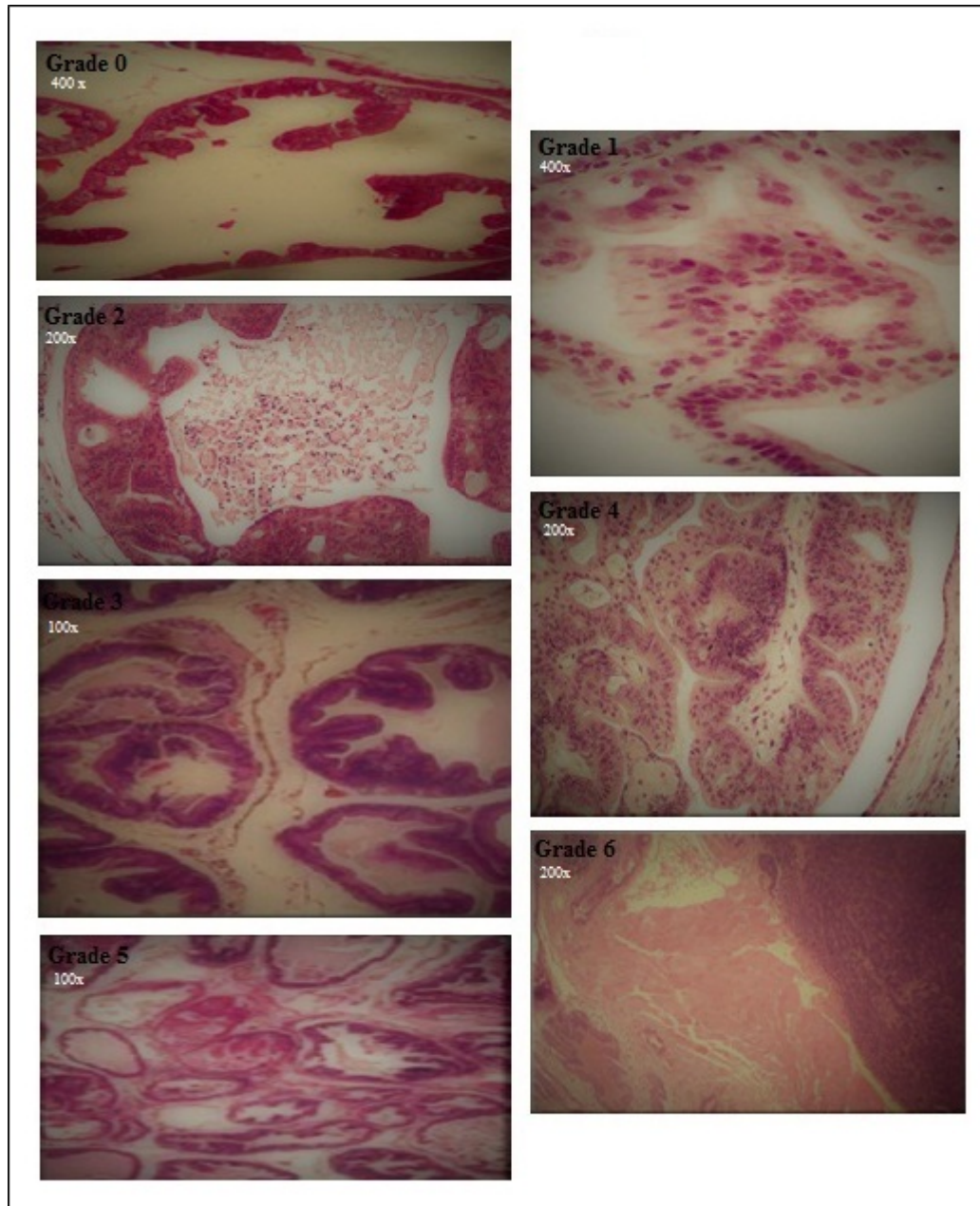
Figure 1: The original microscopic images for histology results of prostate. Grade 0: Normal epithelium. Grade 1: hyperplasia; Simple flat lesions. Grade 2: hyperplasia; Papillary or cribriform structures. Grade 3: hyperplasia; Papillary or cribriform lesions which protrude into lumen. Grade 4: adenoma; Lesions in which the lumen of acinus is completely filled with epithelium. Grade 5: adenoma; Lesion with a distinct epithelial mass within the lumen. Grade 6: adenocarcinoma, unwell differentiated epithelium with local invasion seems in the lesion.

the microscopic observations. Aerobic training alone didn't show a significant change in this regard. These microscopic observations are inconsistent with the results of pro-oxidant-antioxidant balance (PAB). PAB results were only significantly higher in the PC and PC+EXR groups when compared