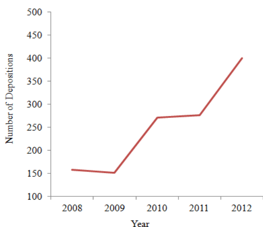
Figure 1: Deposition of EM Structures in EMDB in last five years

lecular assemblies (having molecular weights greater than 60 kDa) and other larger cellular components. There is no need for growing 2D crystals for 3DTEM methods; it mainly relies on the symmetry properties of particle (Jonic et al., 2008). The increase in the number of electron microscopy (EM) solved structures is evident from the collaboration of the ftp archives of Protein Data Bank (PDB) and EM Data Bank (EMDB) to facilitate user access to EM maps and models (Berman et al., 2013). According to EM databank statistics, 1749 entries were deposited in its database ( http://www.emdatabank.org/recententries.html ) till February, 2013 and with a gradual increase in data submission in EMDDB in the last five years (Figure 1).