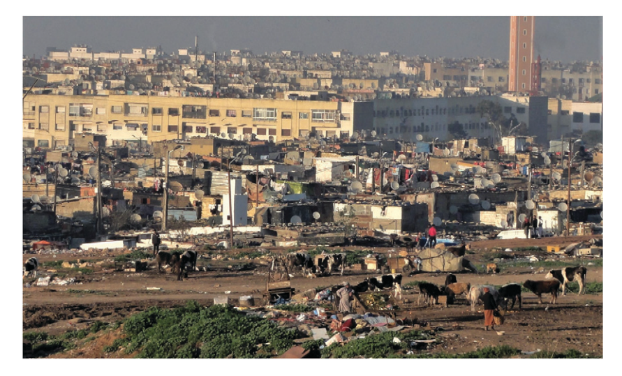
Figure 1. An outside perspective of Casablanca's Er-Rhamna shantytown. Author's picture, Feb 2017.

Dovey and King, 2011; Figure 1), leading them to fast judgements like 'sub-standard', 'poor', 'informal', 'dangerous' or 'exotic'. As they do not look like the imagined 'formal', 'planned' or 'developed' city – following mainly Western ideals of city planning (Robinson, 2006; Watson, 2009) – they are wished to disappear (cf. Beier, 2021; Erman, 2019; Meth, 2020). Destructive housing programmes, slum-centric international development campaigns, but also slum tourism are only some of its consequences.