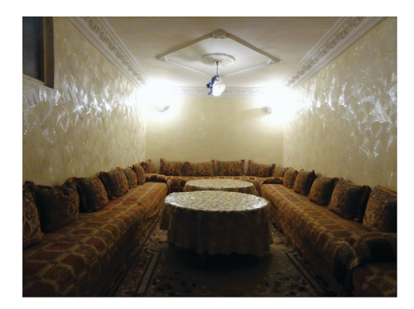
Figure 2. Inside one of the high-end houses of Casablanca's Er-Rhamna shantytown. Author's picture, Mar 2017.